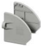
Flange cover, Color: gray