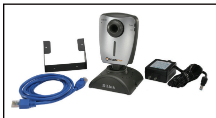
DLINKS Web Camera Kit