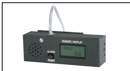
9318-0506 Remote PDU Display