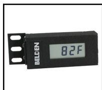
9318-0513 Temperature Display with Thermocouple