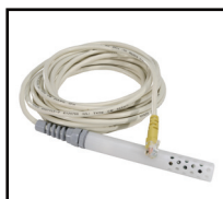
9318-0503 Temp/Air Flow/Humidity Remote Sensor